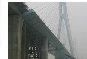
An Qing Bridge