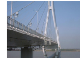
2nd Nanjing Bridge