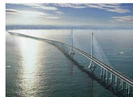
Chong Ming Bridge