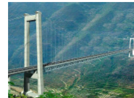
Ba Lin He Bridge