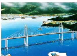
Machang Bay Bridge