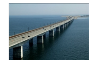
Storebaelt West Bridge