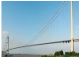
Run Yang - Nan Cha Bridge

*) In use for large modular expansion joints since 2003.