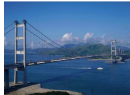
Tsing Ma Bridge