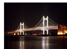
Kwang Ahn Bridge