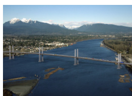
Golden Ears Bridge