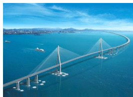
Incheon Grand Bridge