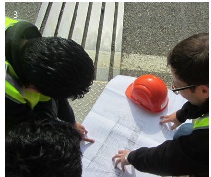
1 mageba team preparing for an inspection 2 On-site status analysis of bridge bearings 3 On-site inspection of an expansion joint