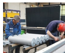
Repair and Replacement